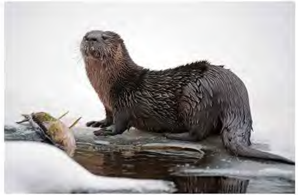
Fish make up the bulk of an otter's diet.

Otters are what wildlife biologists call "apex predators," meaning they're at the top of the food chain. They have few enemies in the wild. This may seem unusual when you consider that otters aren't very big as far as top predators go. But what they lack in size, they more than make up for in feistiness against attackers.