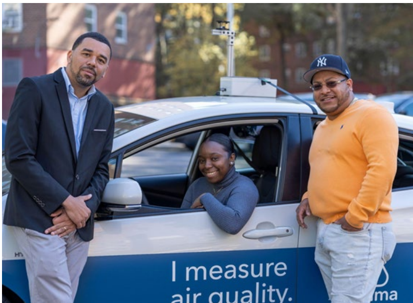
Mobile air monitoring will be conducted using Aclima hybrid vehicles. Drivers will be trained through a partnership between Aclima and BlocPower.

To measure air pollution from sources such as cars, diesel trucks, construction equipment, commercial operations, and industrial facilities, cars equipped with sensors will drive throughout the neighborhood. The information collected will be used to create maps that show air pollutant estimates for every 100 meters (about 330 feet of road) across the community. This information will help identify air quality issues and help guide actions to reduce localized pollutant levels and target sources of greenhouse gases. The pollutants that will be measured include carbon dioxide, carbon monoxide, nitric oxide, nitrogen dioxide, ozone, fine particulate matter, methane, ethane, black carbon, and targeted toxics. The map below is an example of pollutant measurements for fine particulate matter (called PM_{2.5} ) in a similar study conducted in California. These maps and data will be made available to local organizations in the 10 communities.