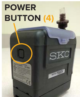
POWER BUTTON (4)