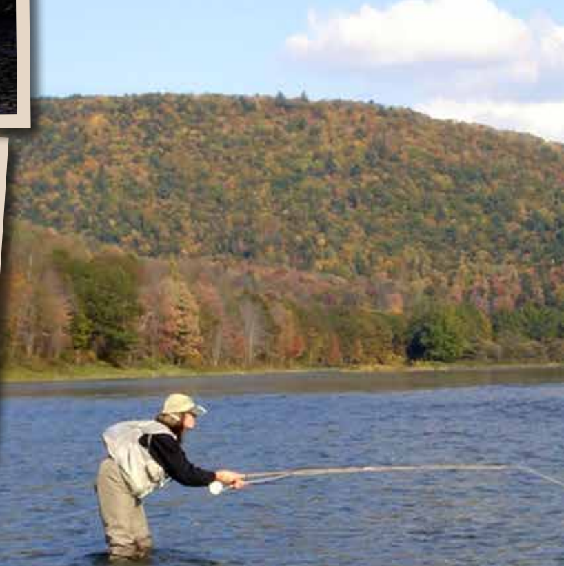
East Branch Delaware River