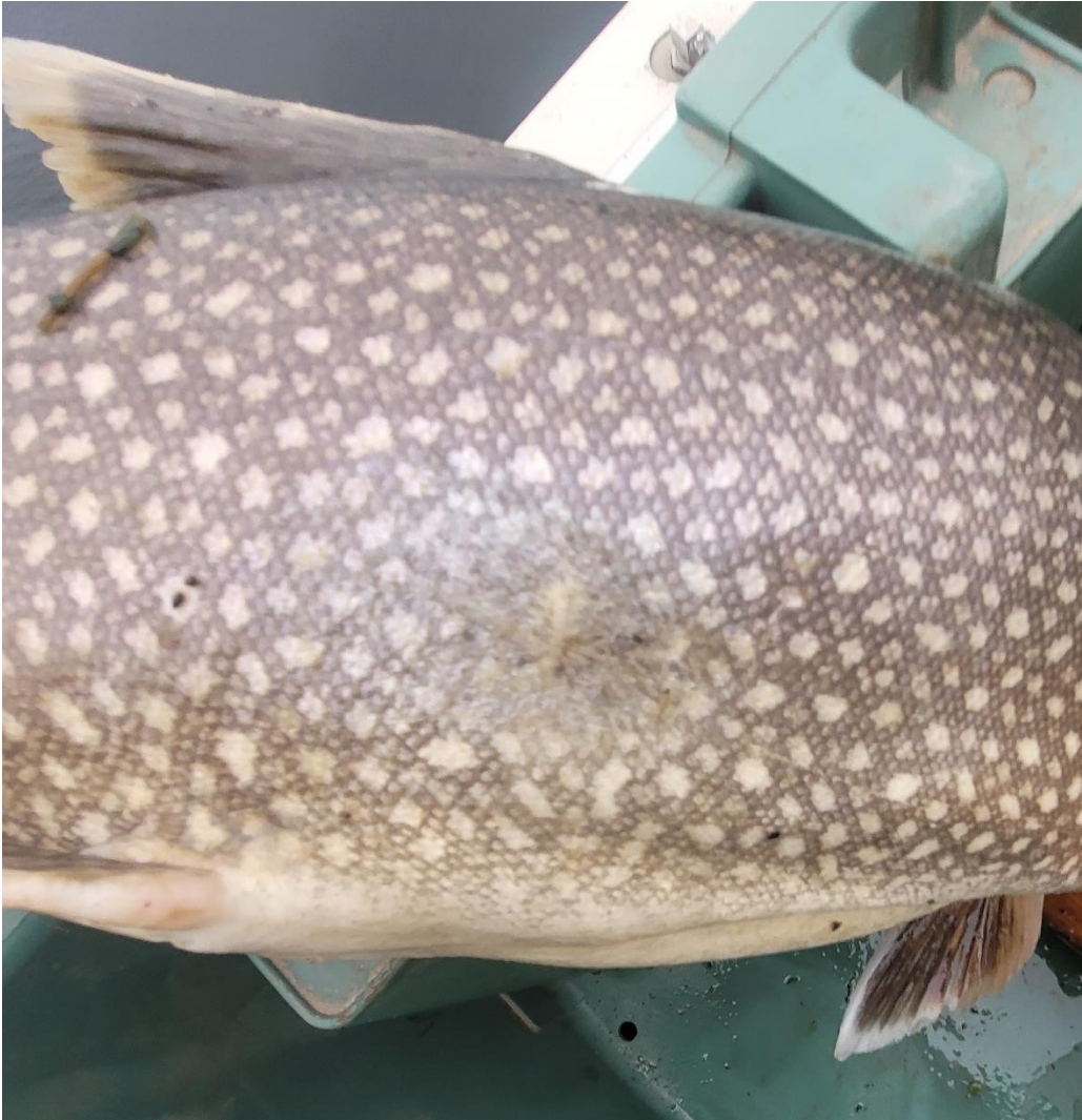
Figure 2. Lake trout with an older sea lamprey wound which mostly healed.

Sea lamprey control is essential for maintaining a viable coldwater fishery in Cayuga Lake. We will continue to monitor sea lamprey wounding rates on both rainbow trout at the Cayuga Inlet Fishway and lake trout during future egg takes. In addition, staff will continue to monitor for the presence of sea lamprey spawning and/or larval survival in Cayuga Inlet since, if left uncontrolled, it is by far the largest source of sea lamprey in Cayuga Lake. If a larval population of sea lamprey becomes established in Cayuga Inlet, we will need to consider a lampricide treatment of Cayuga Inlet.