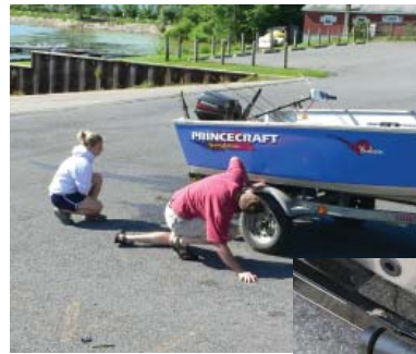
Check all possible attachment points on your boat and trailer for clinging plants and debris.