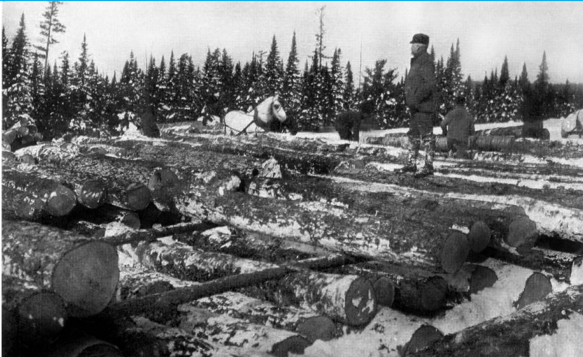
Colonel Fox at Cornell University's College of Forestry at Axton