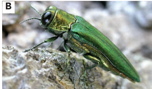
Michigan State University