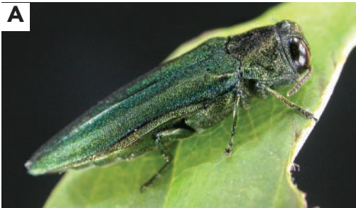
Michigan State University