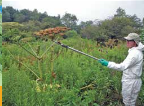
Removing seed heads