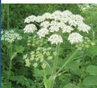
Cow Parsnip May cause burns.