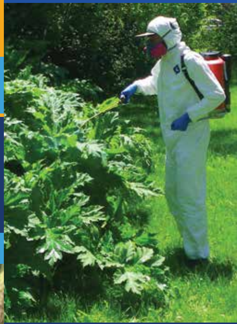
Spraying with herbicide

Its sap can cause painful burns, permanent scarring and even blindness.