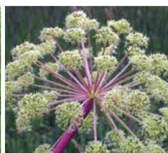
Angelica May cause burns.