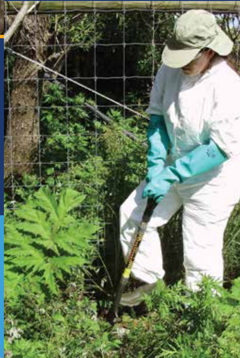
Cutting the plant root