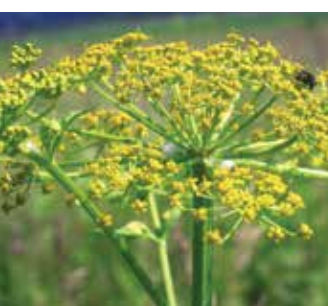
Wild Parsnip DON'T TOUCH! CAN CAUSE SEVERE BURNS.

Giant hogweed is an invasive, non-native plant classified as a noxious weed. It is unlawful to propagate, sell or transport. In addition to being a health concern, it crowds out other plants and causes soil erosion.