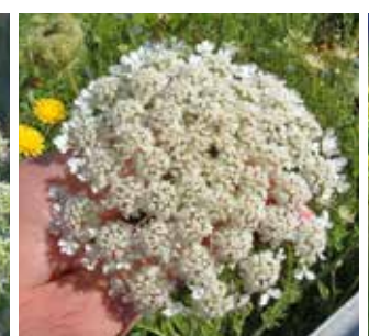
Queen Anne's Lace