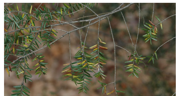
HWA damage to needles and branches