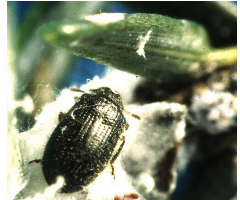
Laricobius nigrinus feeding on HWA

Chemical insecticides can be used to treat an already infested tree or as a preventive measure in a high-risk infestation area. They are useful for treating individual, ornamental, or high-value trees, but are not practical or economical in a forest setting. Two insecticides that have shown promising results are Imidacloprid and Dinotefuran. Both must be applied by a licensed pesticide applicator, and either can kill HWA on its own. Applying both insecticides to an infested tree, however, combines the immediate effectiveness of the fast-acting Dinotefuran with the long-term protection of Imidacloprid, leaving the tree adelgid free for up to seven years.