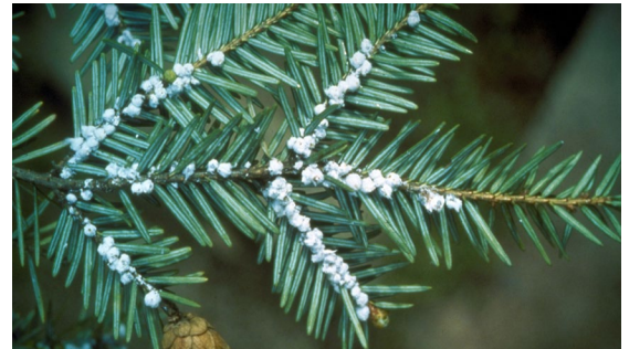
White woolly ovisacs on an eastern hemlock branch