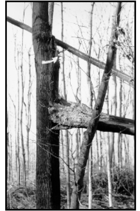
Fig. 5. Decay weakened the right hand fork of this maple bole. Arrow indicates original point of attachment and location of decay.