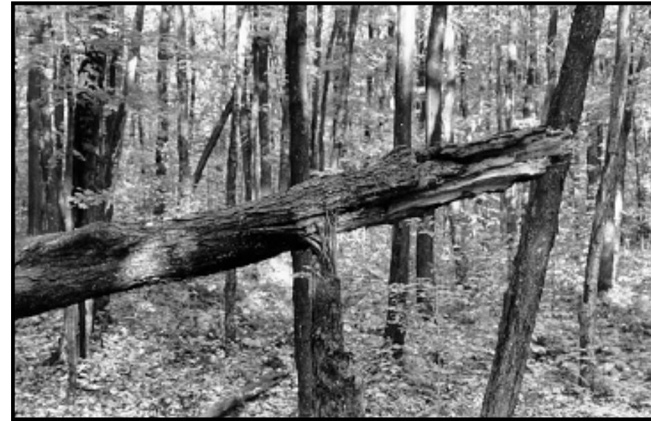
Fig. 4. Sugar maple bole broken or "snapped" at point of injury.