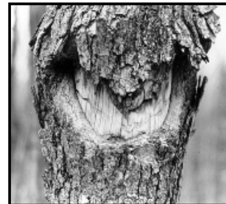
Fig. 3. Below. Bole weakened by a canker fungus.