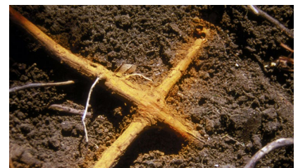
Root graft