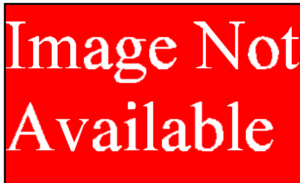
FORESTPORT STATION...circa 1992

Although 87 percent of the line is within the Adirondack Park, only a total of roughly 46 miles is bordered by State Forest Preserve land. A majority of the Corridor lies on private, remote and physically inaccessible land holdings. Access to most of the line is prohibited through posting by paper companies, private fish and game clubs, and the owners of large estates. Considering the rugged nature of the area, it is not surprising to find a low human population density. The exceptions of course, are a few hamlets including most of the largest centers of population within the Adirondack Park; Old Forge, Saranac Lake, and Tupper Lake.