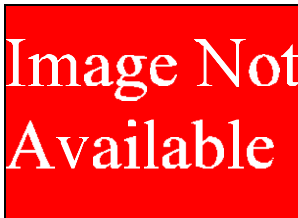
THENDARA STATION...circa 1992

The costs of enforcement, fire protection and search and rescue services will be minimized through the measures to be taken to reduce the need for such services, as discussed in section "H." above.