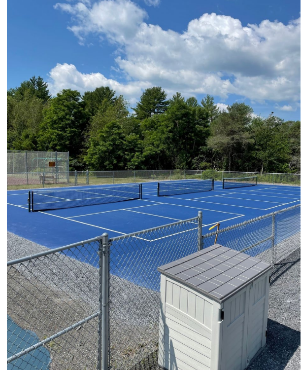
Willsboro Pickleball Courts