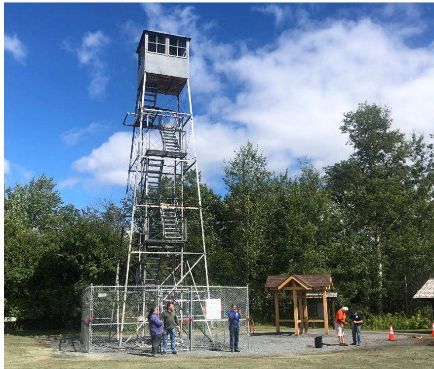
Speculator Village Park