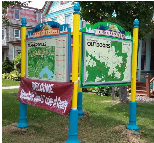
Downtown kiosk in Tannersville