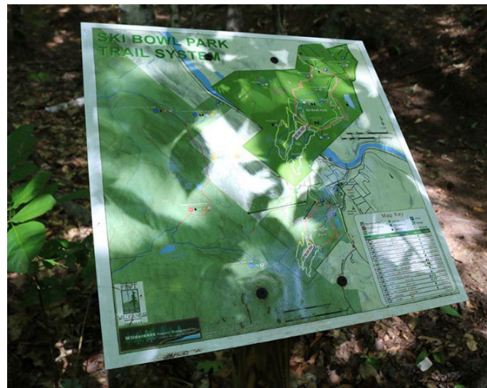
Recreational trail systems / signage