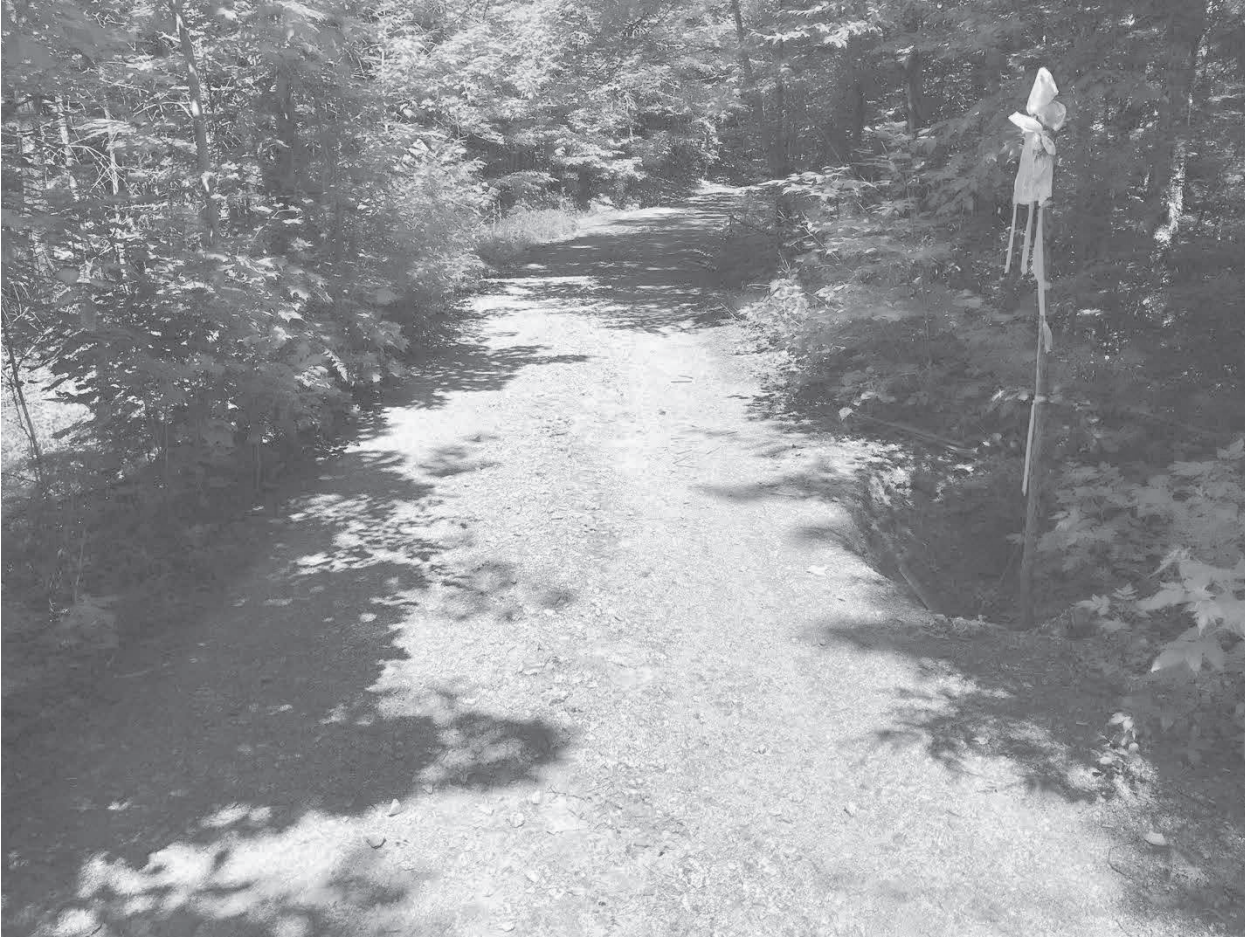
Sinkhole on shoulder of roadbed. 7/24/2020 12pm

Enter any additional supporting material, photos, maps or other attachments here.