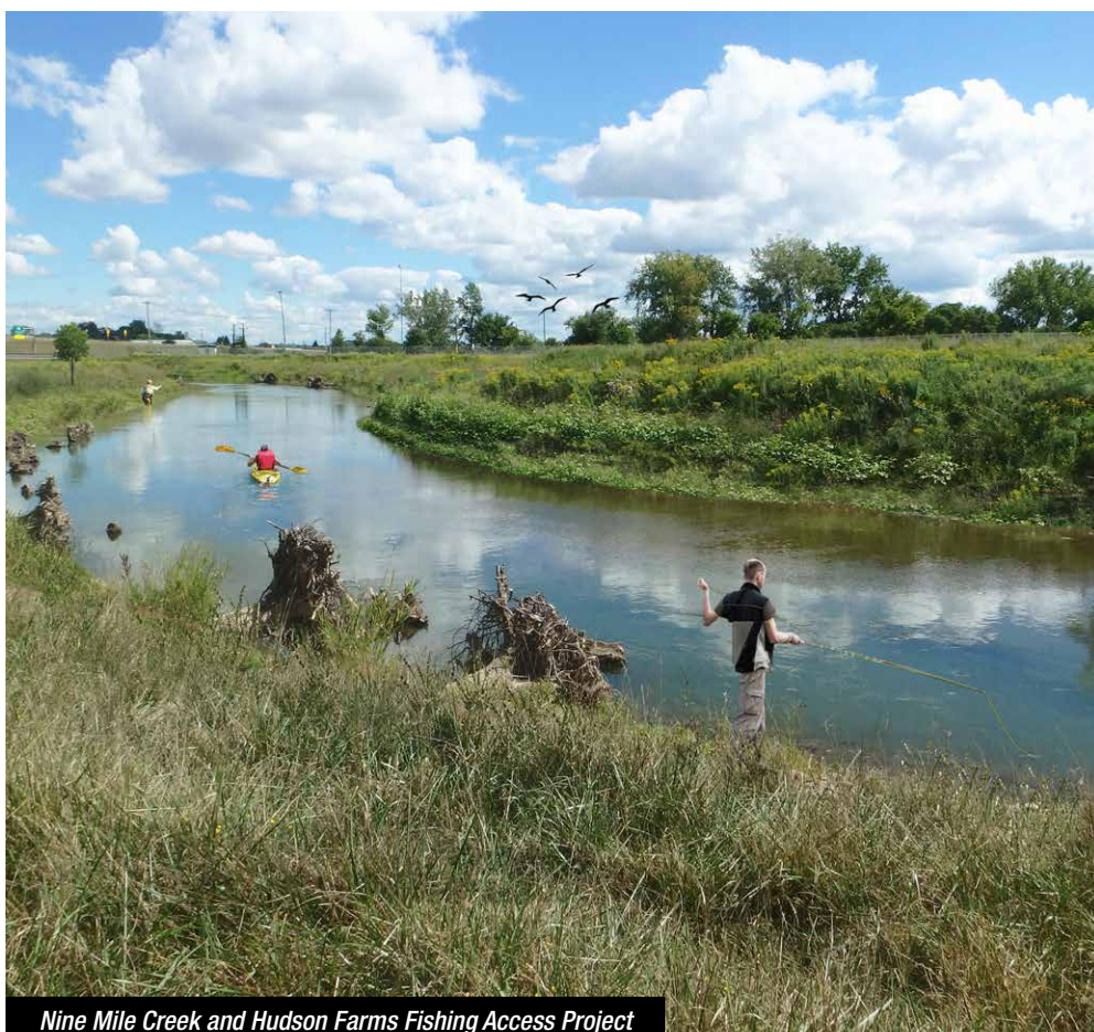
Nine Mile Creek and Hudson Farms Fishing Access Project

Onondaga Lake Natural Resource Damage Assessment and Restoration Information: