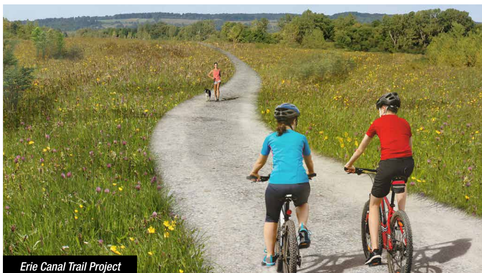
Erie Canal Trail Project