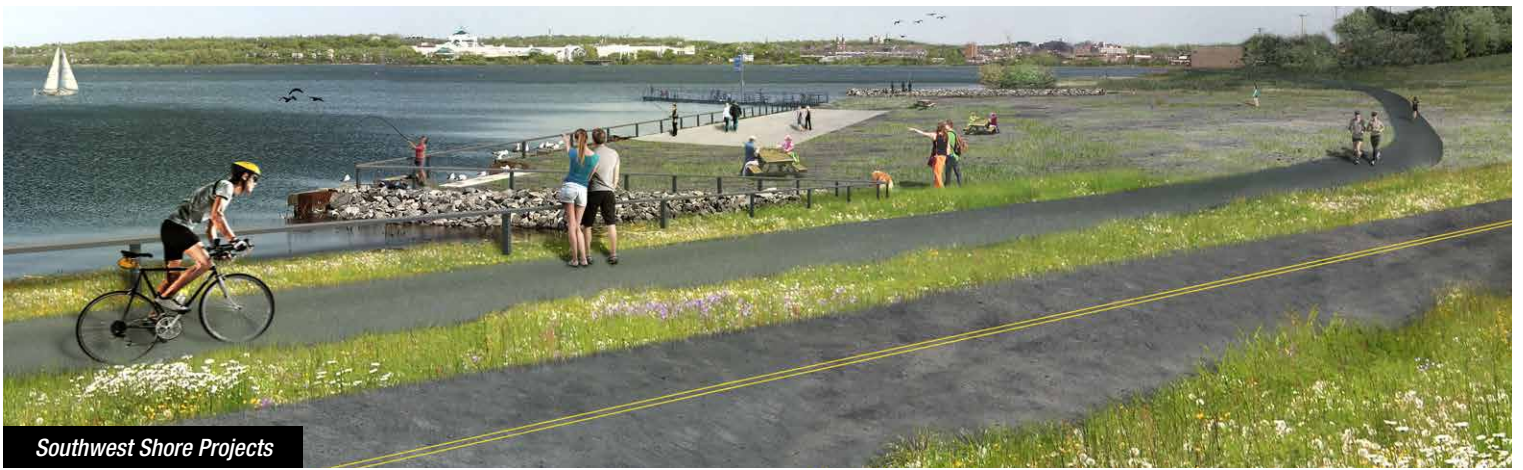
Southwest Shore Projects