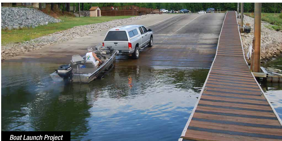
Boat Launch Project