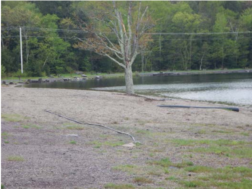
Exhibit #12-Existing stone stairway from main parking area to beach