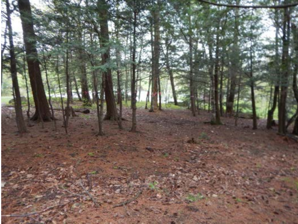
Exhibit #6-Proposed location of two relocated accessible parking spaces