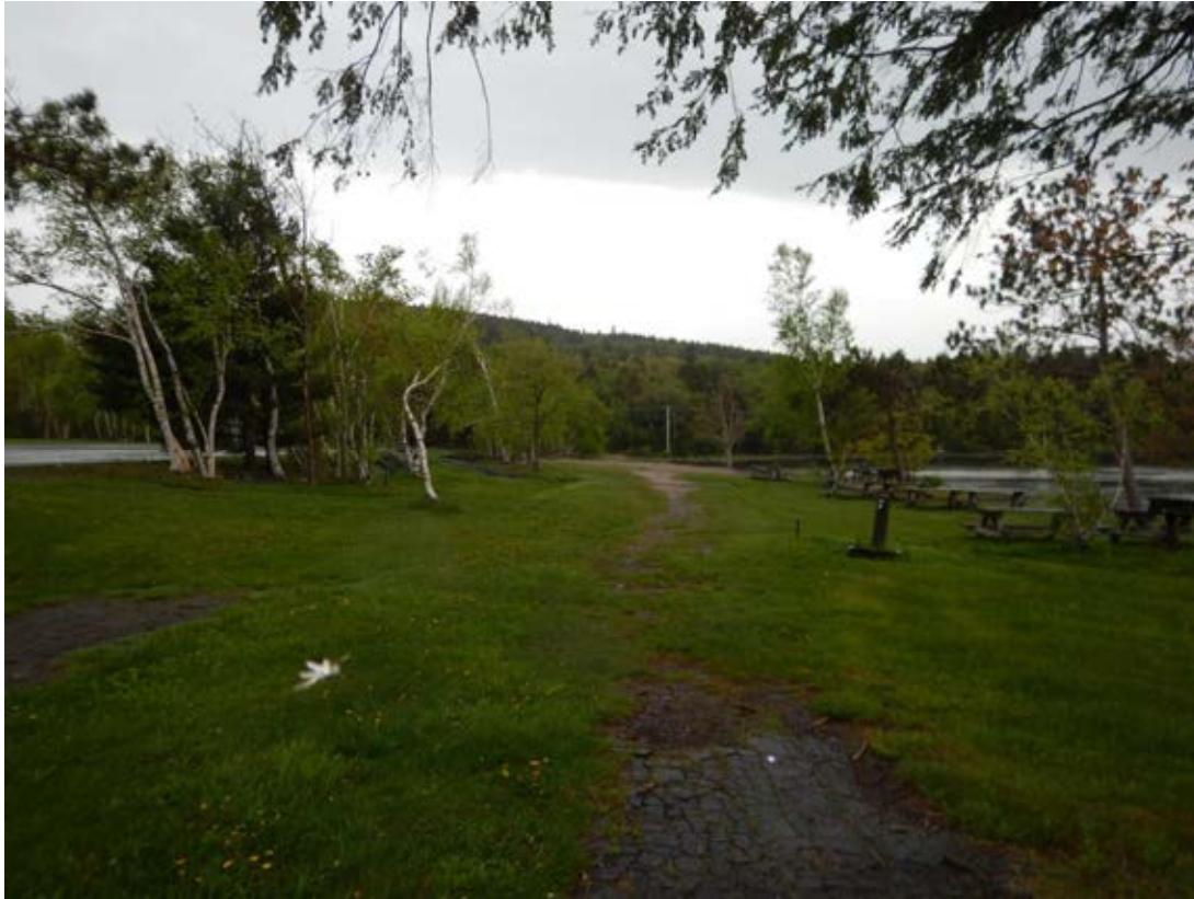
Exhibit #10-North Lake Day Use existing tables and grills