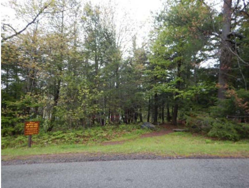
Exhibit #4-Proposed gravel parking area