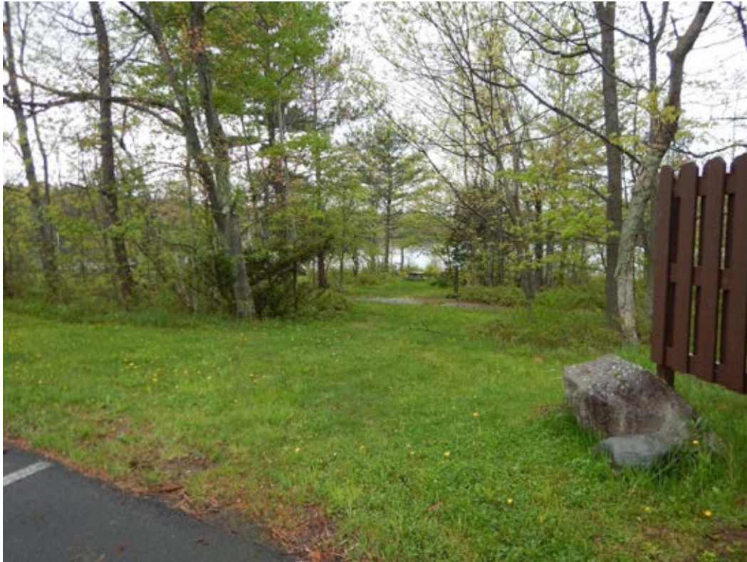
Exhibit #8-Old paved path that will be removed