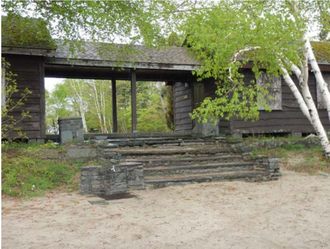
Exhibit #16-Existing spigot that will be replaced