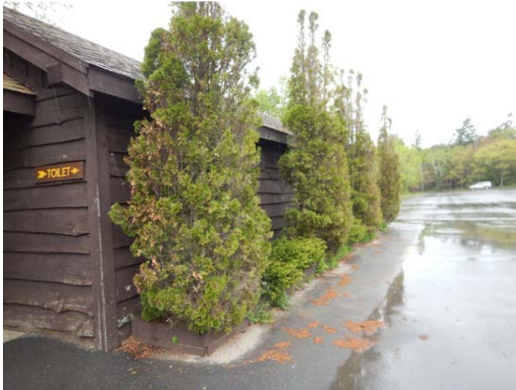
Exhibit #18-Proposed location of concrete accessible sidewalk connecting proposed parking lot crosswalk to the changing room and beach