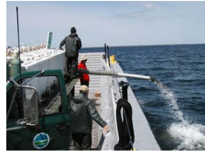
Barge stocking brown trout on Lake Ontario.

Many of Central New York waters receive yearly stockings of fish from New York State Fish