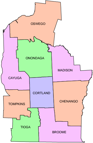
Central New York covers Broome, Cayuga, Chenango, Cortland, Madison, Onondaga, Oswego, Tioga, and Tompkins Counties.

Central New York encompasses a nine county area and offers a very diverse fishery from Lake Ontario in the north to the Susquehanna River in the south. There are a variety of rivers, streams, lakes and ponds spread throughout Central New York. Four of New York's Finger Lakes (Cayuga, Oswego, Skaneateles and Otisco) lie within the region. Some other popular water bodies include Oneida Lake,