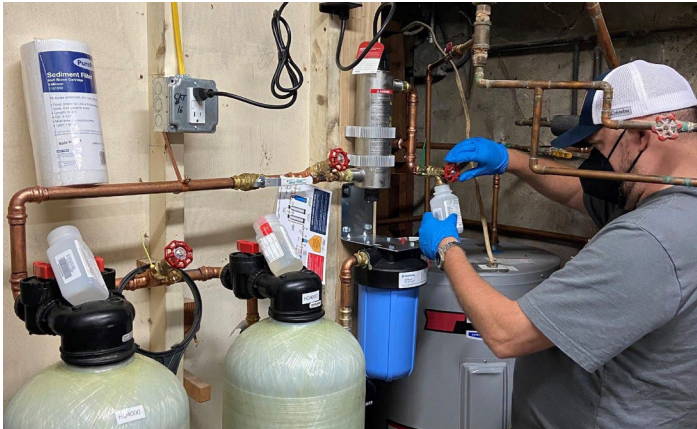
Point of Entry Treatment System and Maintenance Sampling