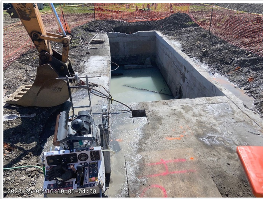
Figure 6: OS2 Structure

The area is on private property and is currently secured with fencing to deter access and prevent exposures to impacted material while other removal or closure alternatives are being evaluated. A work plan for further onsite investigation activities has been submitted to DEC, which is being reviewed.