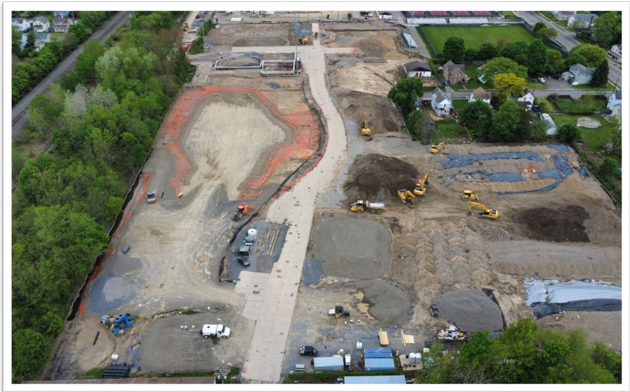
Figure 2: IRM #5A2 May 2022 (looking south)

estimated 67,600 cubic yards of soil (approximately 69,000 tons) were excavated and disposed of off-site at approved facilities. Excavation and waste shipment are ongoing (Figure 2).