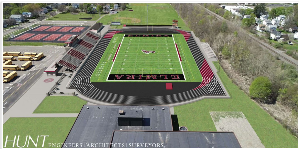
Figure 3: Architectural Rendering - Elmira High School Athletic Complex (looking north) ( https://www.elmiracityschools.com/news/what_s_new/new_elmira_high_school_stadium )

ECSD has been coordinating the construction of the new stadium and athletic complex in phases as the remedial cleanup work is completed by Unisys., This construction work will not negatively impact the ongoing remedial program, as DEC will ensure protection of public health and the environment during the project. The football field complex portion (see Figures 3) of the athletic complex is anticipated to be ready by Fall 2022.