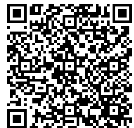
Hudson River SB CAP QR Code

Note: If you open the app before following the QR code or web link, it will ask you to sign in. You should not need to do this.