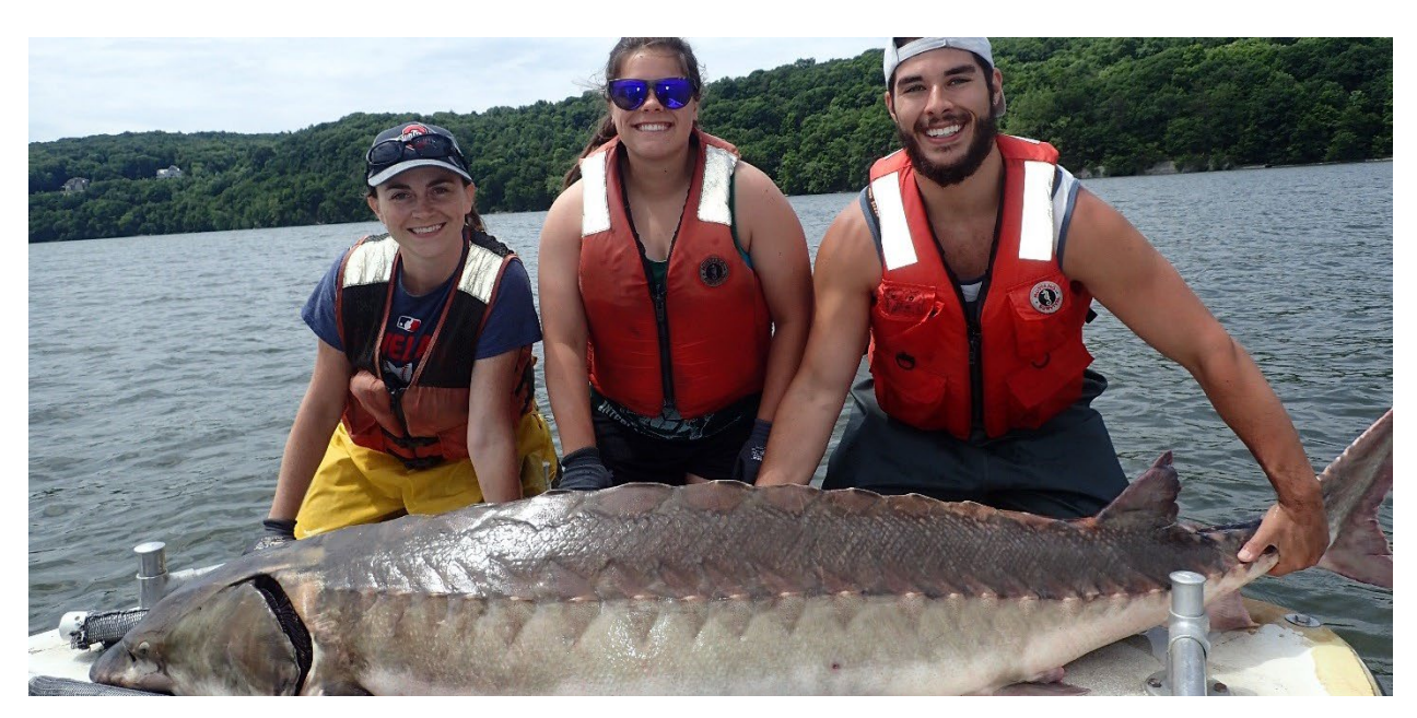
Basil Seggos, Commissioner