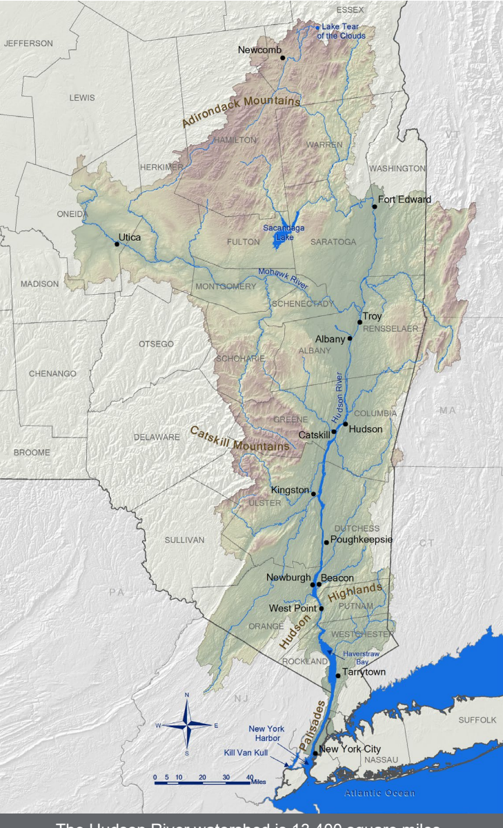
The Hudson River watershed is 13,400 square miles. The Estuary Program focuses on the 5,200 square miles from the Verrazzano Narrows below Manhattan Island to the head of tide at the federal dam in Troy.

The Mohawk River is the Hudson's largest and best-known tributary stream. The Estuary Program focuses on the lower half of the Hudson, south of its confluence with the