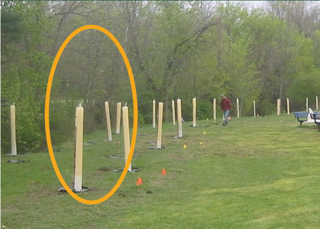
The same site in spring 2012

Maintenance of your Trees for Tribs site helps assure the long-term success of your plants and the overall strength of your new stream buffer. This guide provides step-by-step instructions for maintenance of your Trees for Tribs site. Plan to visit your site at least twice a year and also after major storms or extended dry periods.