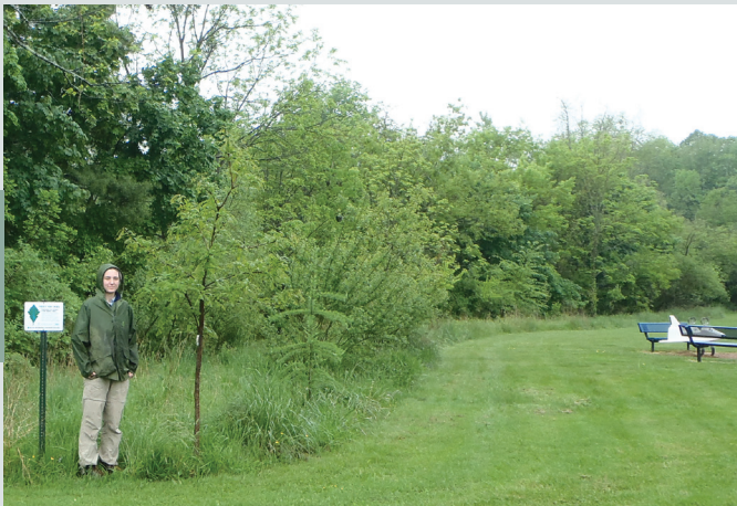
A planting site after four years' growth. The circle highlights the same tree.