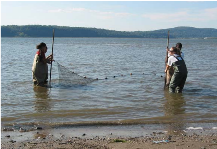
Seine nets can be used to catch fish in shallow water.

During the Day in the Life of the Hudson River event each fall, students catch fish at many places along the river. Then they compare results to see where different kinds of fish live. The location of each place is given in Hudson River Miles . River Mile 0 is in New York City. Going north towards Albany, the mile numbers get higher. Yonkers is at Hudson River Mile 18. Beacon is at Hudson River Mile 61.