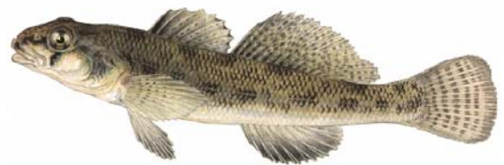
(b) tessellated darter _____