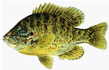
(c) pumpkinseed _____