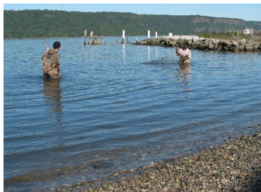
Yonkers is on the east side of the Hudson at Hudson River Mile 18.