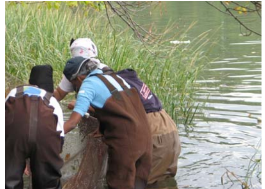
Inwood Hill Park is near Hudson River Mile 14.