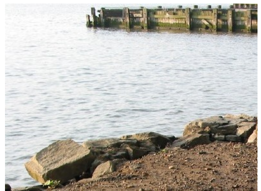
Alpine is on the west side of the Hudson at Hudson River Mile 18.