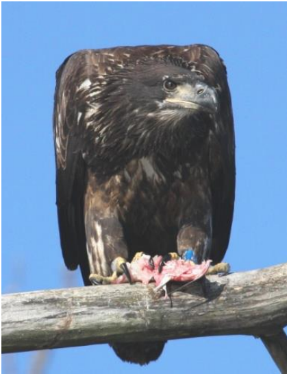
Eagle photos by Mike Pogue

What would you do without food? Could you grow big? Would you be able to run and play?