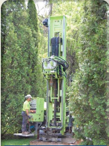
Photo 1: Rotary Vibratory Drill Rig – Well Installation at John Street

https://gisservices.dec.ny.gov/gis/dil/index.html?rs=442049