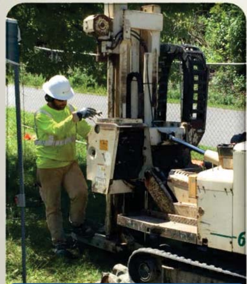
Photo 2: Direct push rig – soil and groundwater sampling at John Street

In addition to the environmental sampling, Honeywell is planning an IRM to install a permeable barrier beneath the ground surface. The barrier is comprised of colloidal carbon material and iron that will adsorb site contaminants, not unlike activated carbon. The addition of this iron will enhance degradation of chlorinated volatile organic compounds in the aquifer. The installation of the permeable barrier will be achieved by direct push drilling technologies. Direct push drilling has been utilized in and around Hoosick Falls throughout the environmental investigations, and a direct push drill rig is pictured in Photo 2.