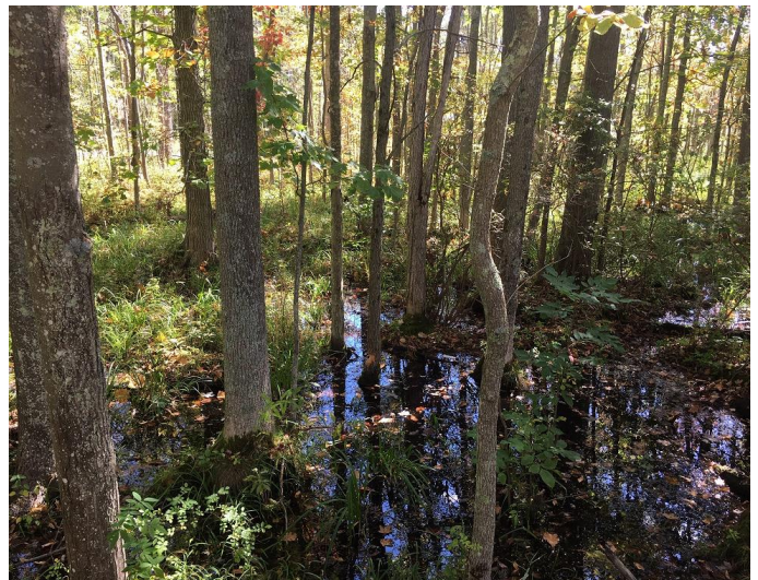
Some wetlands, like this hardwood swamp, may appear dry during certain times of year.