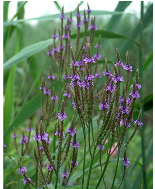
Plants like blue vervain (above) can tolerate prolonged wet soil conditions.