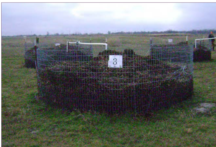
Figure 6-12. Wire bin mini-composter

Models used for composting carcasses are typically about 10 ft. (3 m) in diameter and 50 ft. (15 m) in length (Figure 6-13). Units used for composting carcasses have not been aerated with fans, although fans are used in many other applications. The drums are loaded with a screw conveyor through a port at one end. The compost mix is discharged through unloading doors or shoots at the opposite end. The partially composted and well-blended mix emerges and requires further composting, which can take place in passively aerated piles, bins, windrows or mechanically aerated piles.