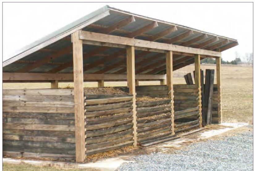
Figure 6-11. Example of a wooden bin used for poultry

Several common styles of mortality composting bins are available. The choice depends on factors that include the type of operation, animal species, regularity and