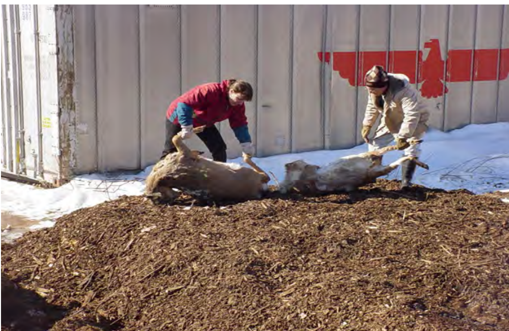
Figure 6-9. Deer carcasses placed on the base layer

4. Cap the pile or bin: The final layer of carcasses should be covered with a thicker layer of amendment. For small to moderate animals, 12 to 18 inches (30 to 45 cm) is typical. For large animals, 18 to 24 inches (45 to 60 cm) is necessary. The appearance of scavengers and flies means that the thickness should be increased. The same amendment used to cover intermediate layers can also be used for the final cap.