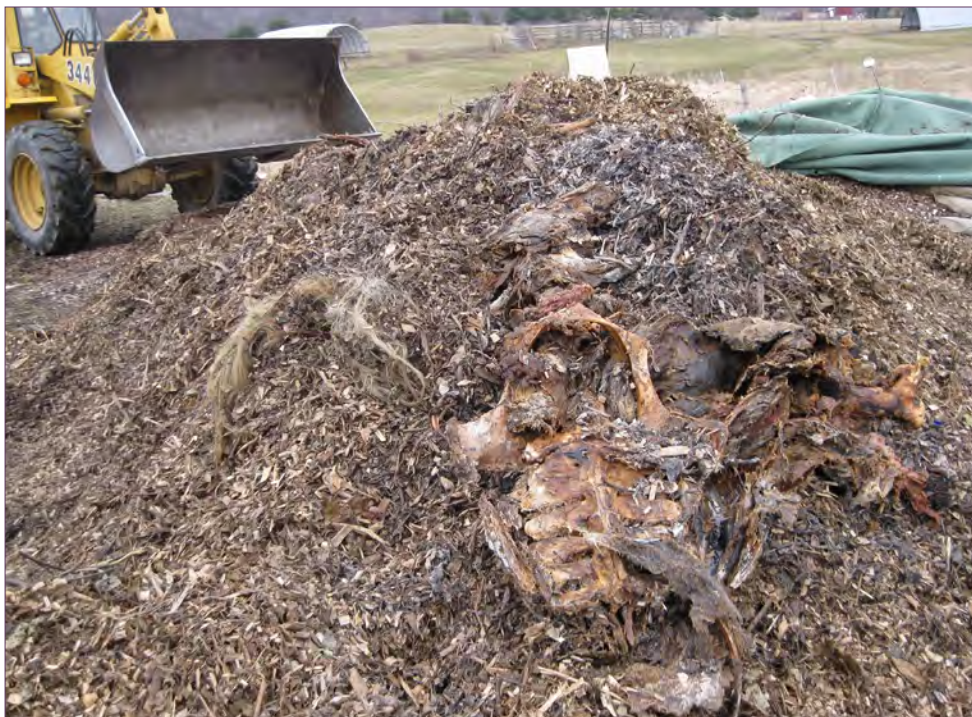
Figure 6-3. Compost pile opened after 4 months. Most of the soft tissue is gone, leaving some hide, hair and bones. The wood chips are dry on the outside having adsorbed and contained leachate and odors.

carcasses (e.g. birds and fish) and moderate carcasses (e.g. pigs, small deer and calves). However, a pile or bin cannot accommodate numerous layers of whole large carcasses, such as mature sows, cattle and horses. Larger animals are typically composted in a pile, windrow or bin with only one or two layers. As more animals are added, additional piles are started or the pile is expanded in length creating a windrow.