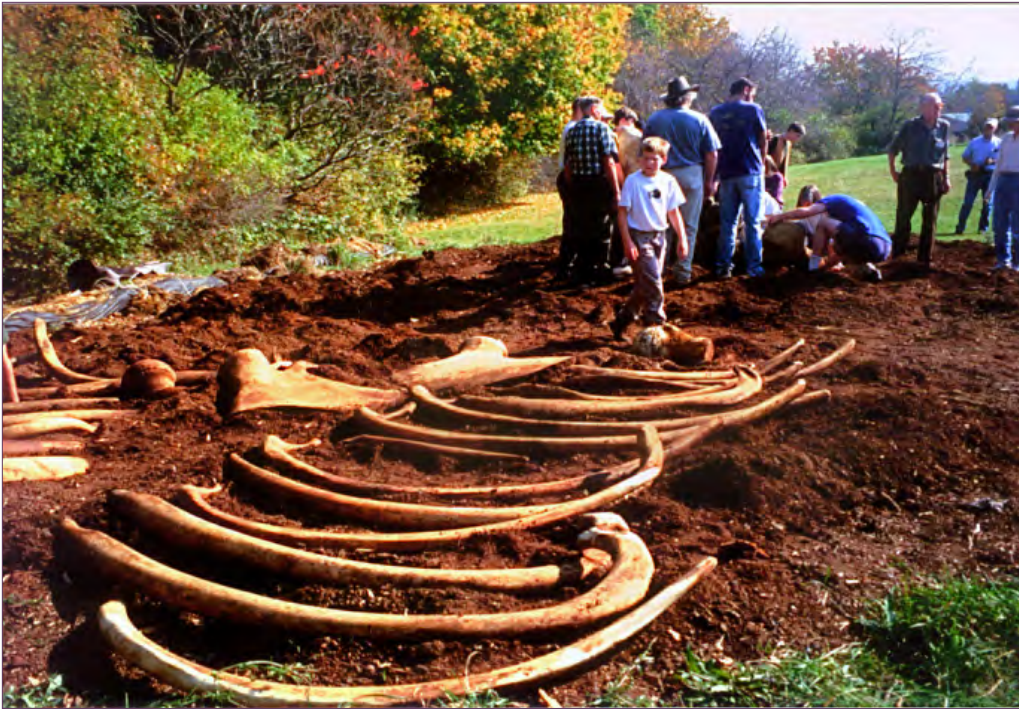
Figure 6-1. Whale bone remains following composting

and is biosecure. The temperatures achieved through the composting process may eliminate or greatly reduce pathogens, hindering the spread of disease. Research continues to demonstrate effective destruction of nearly all livestock diseases of concern. Properly composted material is environmentally safe and a useful soil amendment.