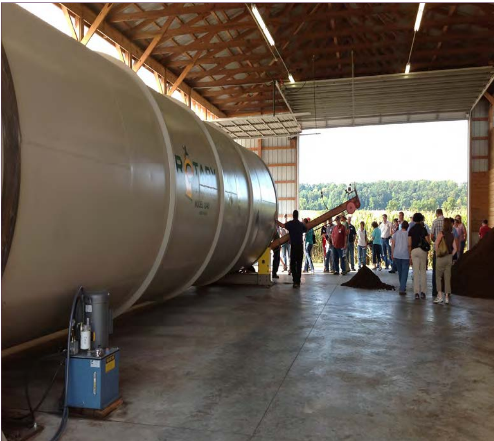
Figure 6-13. Rotating drum for carcass composting