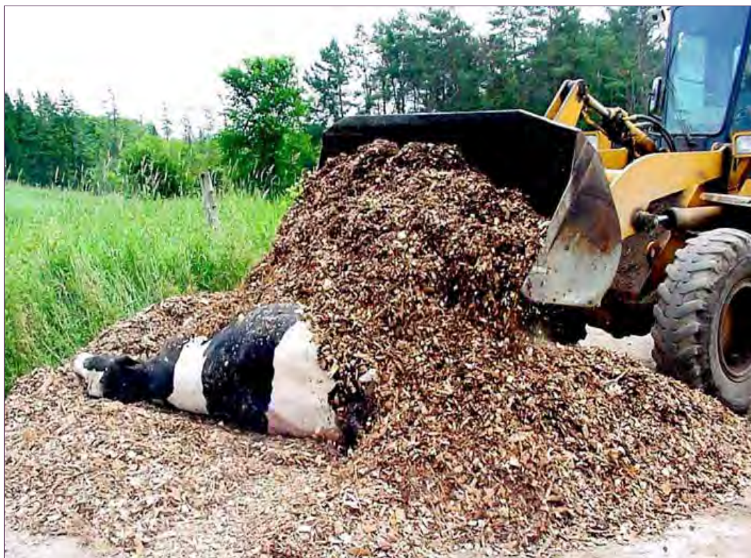
Figure 6-2. Enveloping a carcass with wood chips

Mortality composting methods evolved from the basic passively aerated pile or bin approach developed for composting poultry mortalities. With that approach, a number of carcasses are placed in a layer on a base of dry amendment and capped with more amendment. Layers are built upward in succession until the pile or bin reaches its desired maximum height (Figure 6-4). Layering predominates with small