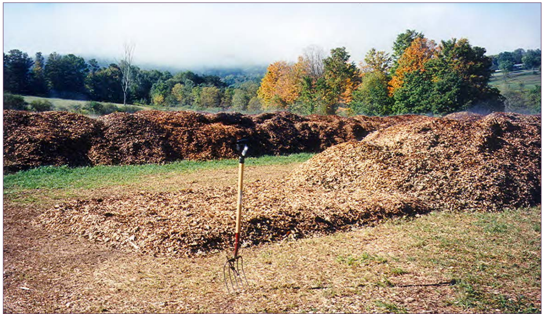
Figure 6-8. Static windrow composting with bed prepared for additional animals or butcher waste

weekly in layers, it is best to stair step the animals into the pile. Build the first end and extend a carbon bed out so that it is ready for additional animals. In the case of large animals, there is no middle layer, so this will be the final cover layer or biofilter and should be 24 inches (61 cm). When animals are added to the pile, dates should be recorded, especially the last one. If it is a windrow, dated flags can be placed in the pile to keep track; one end of a 100 foot (30 m) windrow will be finished before the other. Always make sure animals are well covered to avoid related problems (odor, vermin, etc.).