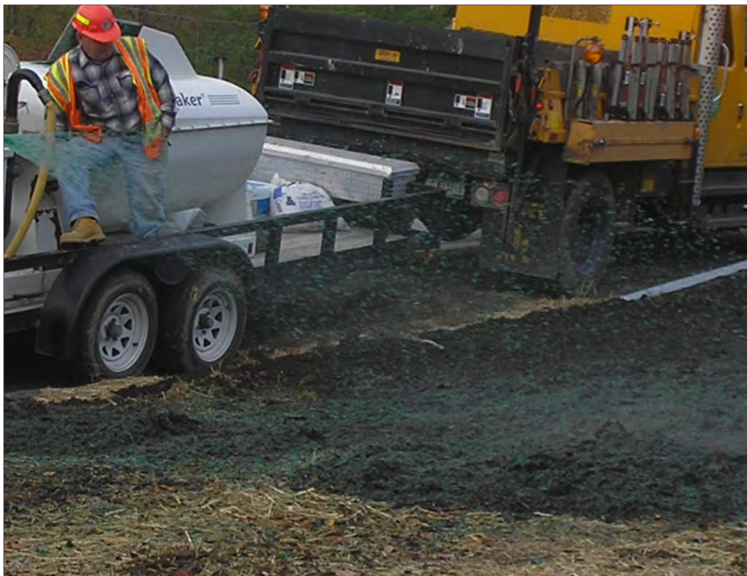
Figure 6-10. NYS Department of Transportation applying road kill compost along highway

compost undisturbed for roughly 2 weeks to 6 months, depending on the largest carcass size and management objectives. The pile/bin should be monitored for temperature, odors, and signs of scavengers, flies and leachate. Any problems that are detected should be corrected (Monitoring Compost Piles or Windrows). In the meantime, new piles or bins may be started to treat additional mortalities.