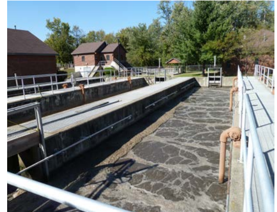
Wastewater treatment plants are regulated by DEC

To understand what a TMDL is, it is important to know the basis for developing one. All waterbodies in New York State are classified to represent their best uses, such as public drinking water supply, swimming, fishing, and fish reproduction/ habitat. New York water quality standards protect these best uses. When a lake or river is identified as not fully supporting its best uses, it is listed on the state's Clean Water Act Section 303(d) List of Impaired Waters. For these listed waters, New York State must develop a TMDL or other strategy to reduce the amount of pollution.