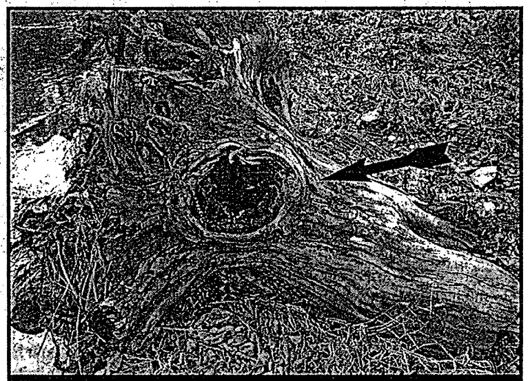
A trap inside the streamside hollow tree makes for a good coon and mink location without bait or lure. The three-foot chain contributes to easy set construction.

A longspring placed far back under an overhanging stream bank puts it where mink or coon normally travel or hunt for crawdads and keeps it away from dogs. A mink or otter will very likely search any hollow log lying in shallow water and a trap pushed way back into the