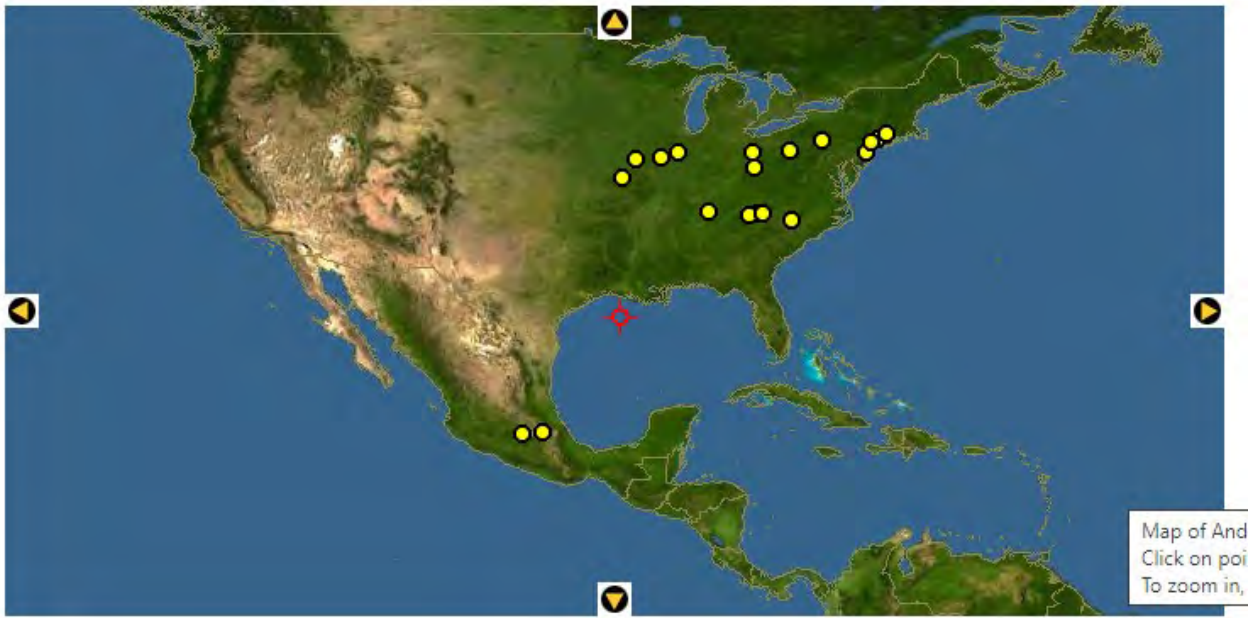
Figure 2. Andrena duplicata distribution (DiscoverLife 2024).