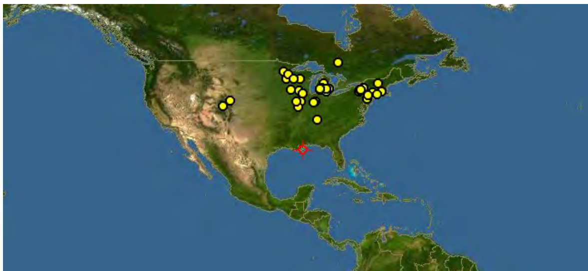
Figure 2: Dufourea monardae distribution (DiscoverLife 2024).