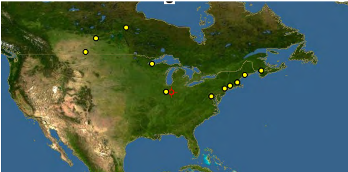
Figure 2. Epeoloides pilosula regional distribution as reported by DiscoverLife (2024).