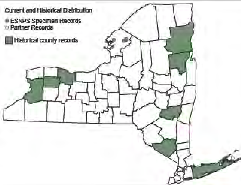
Figure 1: Observations from 2000 to present depicted as dots; those from 1999 and earlier as shaded counties.

(provide map, numbers, and percent of state occupied)