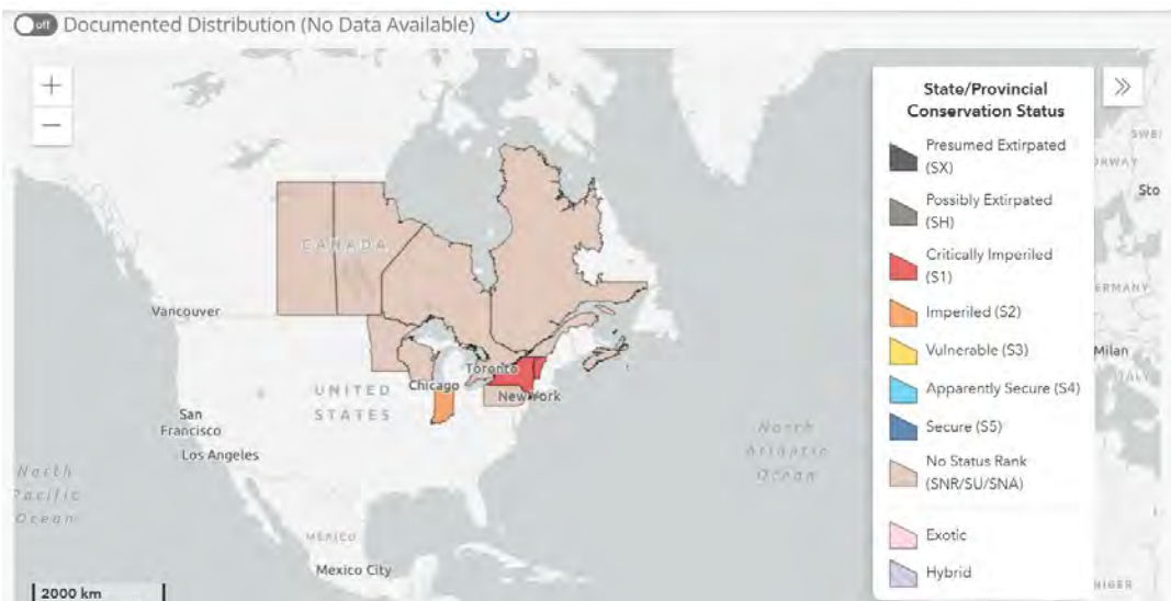
Figure 1. Stelis coarctatus North American distribution (NatureServe 2025).

There are two historical records (1999 and earlier) from Greene and Rensselaer Counties (White et al. 2022) and an unverified record from Monroe County (DiscoverLife 2025). It has been recently documented in Franklin and Onondaga counties (iNaturalist 2024, White et al. 2022) and has likely always been rare in the state.