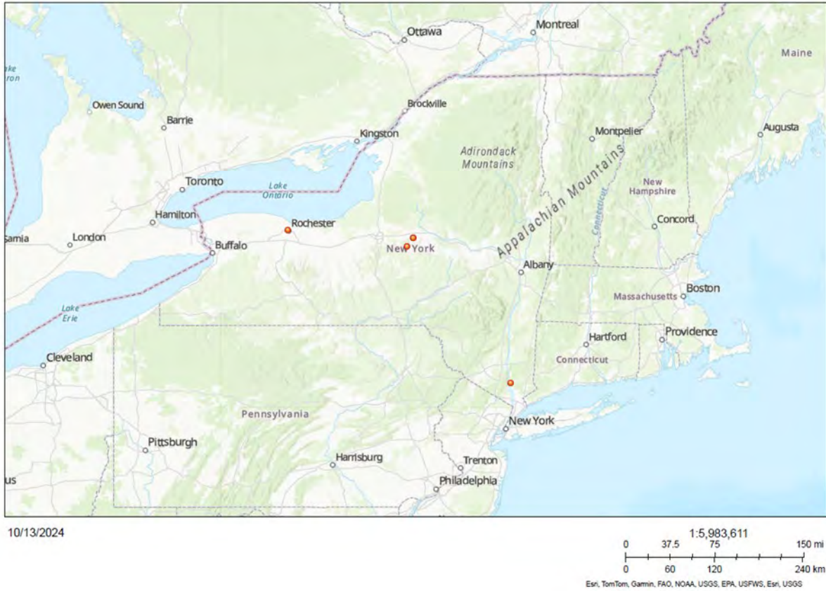
Figure 4: NYS distribution of Pyraclomena lucifera based on historic records (pre-1999) primarily from Green 1957 and Lloyd 2018. These points represent low accuracy from georeferenced locations based on site location and county level descriptions (NYNHP 2024).

Table 1. Number of observations of Pyraclomena lucifera grouped by the dates known to be extant (repeat observations (element occurrences) include the years spanning first observation to last observation) and the number and percent of total of counties these observations fall within for New York State.