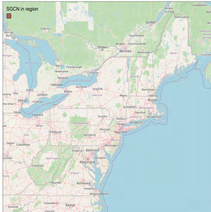
Figure 3: Pyrausta nubilalis regional distribution as reported at https://northeastwildlifediversity.org/rsgcn .