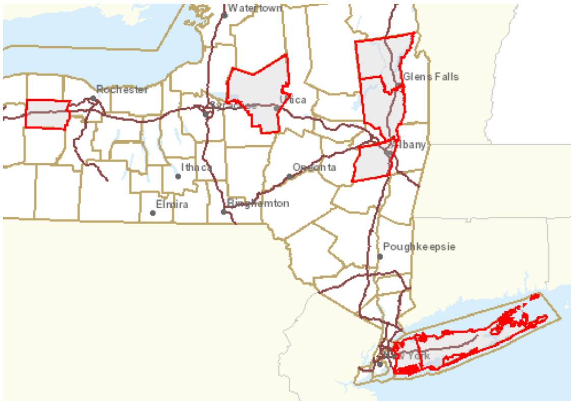
Figure 2. Historic distribution of the frosted elfin in New York