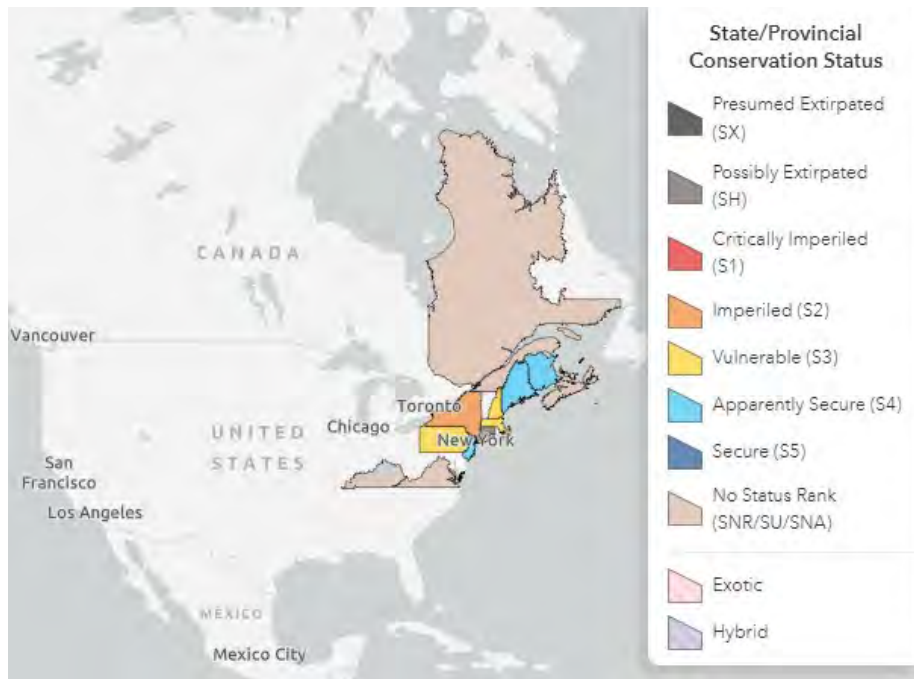
Figure 1. Conservation status of Glenn cognataria in North America (NatureServe 2024).