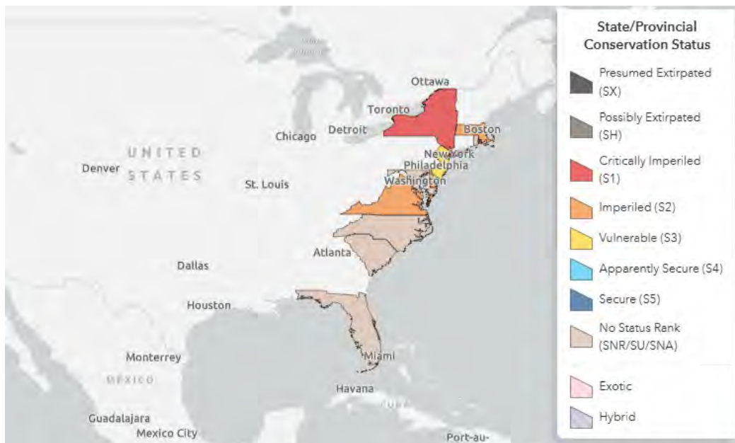
Figure 1. Conservation status of Papaipema stenocelis in North America (NatureServe 2025).

Trends Discussion (insert map of North American/regional distribution and status):