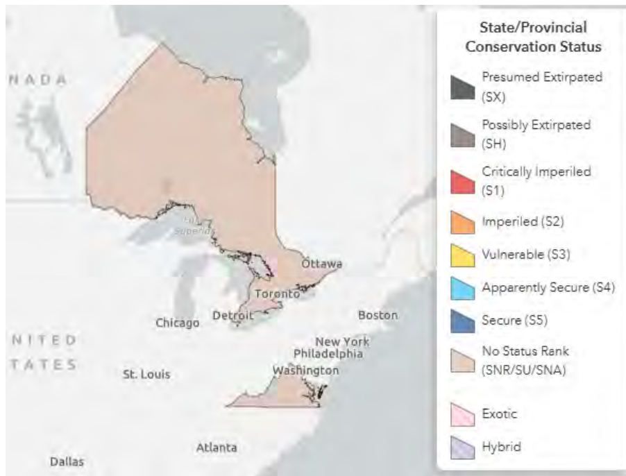
Figure 1. Conservation Status of Hydroptila eramosa in North America (NatureServe2024).

Trends Discussion (insert map of North American/regional distribution and status):