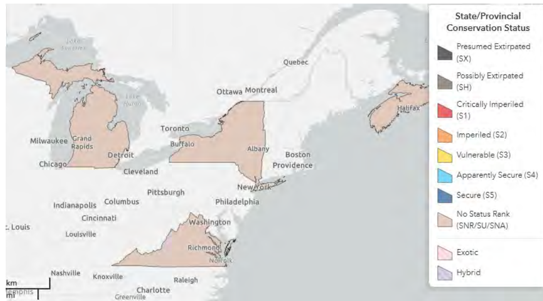
Figure 1. Conservation status of Hydroptila nicoli in North America (NatureServe 2024).

Trends Discussion (insert map of North American/regional distribution and status):