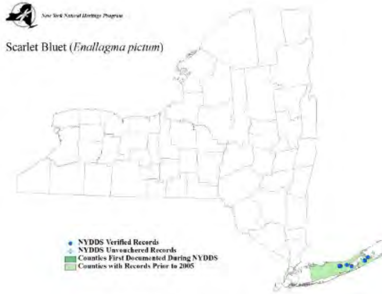
Figure 3. Occurrence records of the scarlet bluet in New York (White et al. 2010).