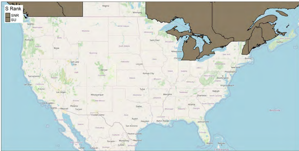
Figure 11: Hammerschmidtia sedmani North American distribution. Points show research-grade iNaturalist observations-note-should also include NY.

The species is historically (1999 and earlier) known from two counties in NY. It has been confirmed in two other counties since 2000. Despite survey effort as part of a statewide pollinator survey, few observations have been confirmed in recent years and it has always been a rare fly in the state.