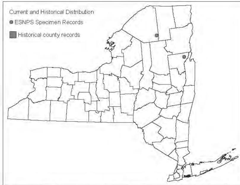
Figure 1: Observations from 2000 to present depicted as dots; those from 1999 and earlier as shaded counties.

(provide map, numbers, and percent of state occupied)