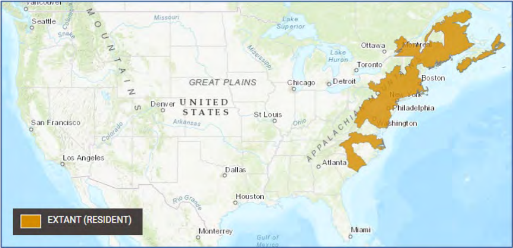
Figure 1. Alewife floater distribution (IUCN Redlist 2024)

Across its range, U. implicata shows a long-term trend of a decline of <30% to increase of 25%, while its short-term trend appears to be relatively stable with change of \leq 10\% (NatureServe 2025).