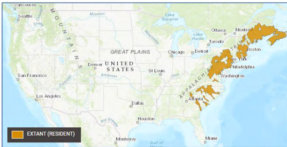
Figure 1. Brook floater distribution (IUCN Redlist 2023)

In the upper Susquehanna basin, A. varicosa was once widespread but is now considered rare and declining (Strayer and Jirka 1997, Strayer and Fetterman 1999). Some scattered populations remain, such as in Catatunk Creek (Lord 2022). The population in the Passaic basin has apparently disappeared. The small population in the New York portion of the Housatonic River basin is believed to be extirpated, as evidenced by extensive surveys of historic sites that yielded only shells (Strayer 2010). The only known population in the Hudson River basin is believed to also be extirpated as the last live individual was documented in 1992 and only deadshell was found in 2001 (Strayer 2001). The population in the Delaware River basin, previously the largest in New York (primarily the Neversink River), has steeply declined and appears to be at risk of extirpation.