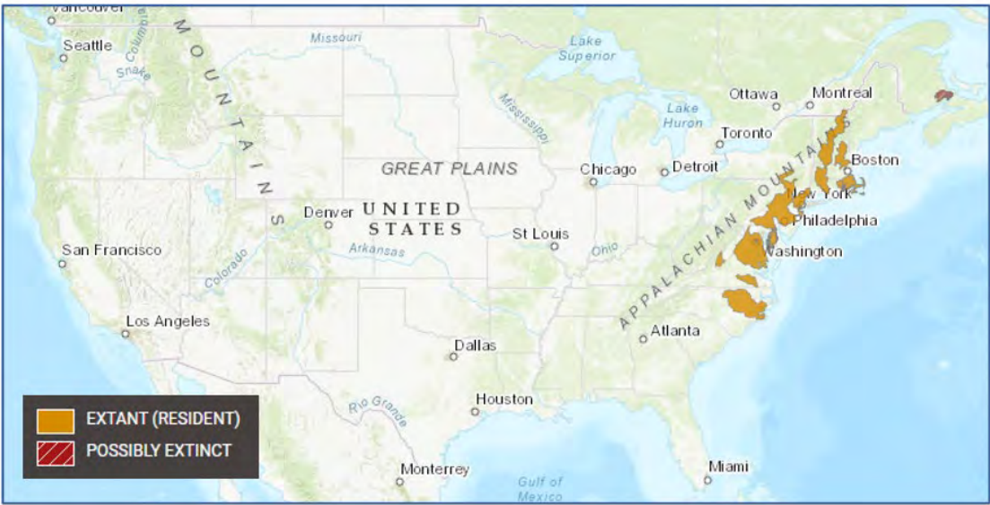
Figure 1. dwarf wedgemussel distribution (IUCN Redlist 2024)

Range wide, P. heterodon has shown a 50% – 80% decline in abundance over the long-term, while short-term trends are unknown (NatureServe 2025). Abundance in New York has declined dramatically over the past 25 years.