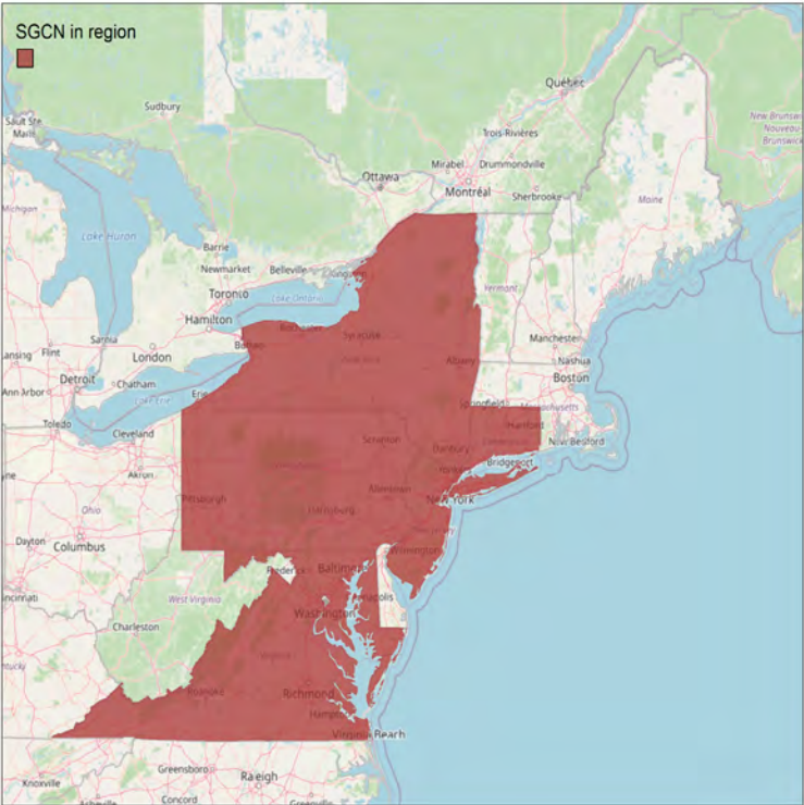
Figure 22: Eubranchipus holmanii regional distribution as reported at https://northeastwildlifediversity.org/rsgcn .