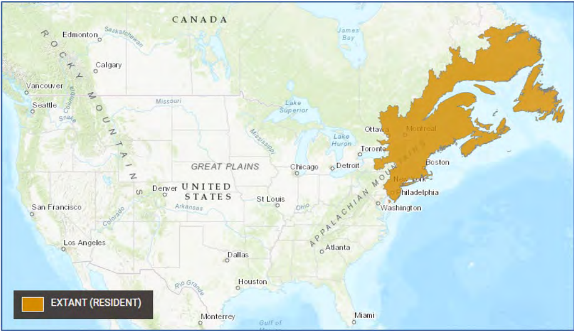
Figure 1. Eastern pearlshell North American distribution (IUCN Redlist 2024)

more comprehensive baseline surveys. For example, mussels were documented for the first time in 50 of the 106 streams surveyed to date by the Southern Lake Ontario mussel inventory project (Mahar & Landry, 2016). This is because many of these streams had never before been surveyed for mussels, not because mussel distribution has dramatically increased. In North America, approximately 2/3 to 3/4 of native mussel species are extinct, listed as endangered or threatened, or are in need of conservation status (Williams et al. 1993; Stein et al. 2000). Based on New York's Natural Heritage S-rank, sparse historical data, and the plight of North America's freshwater mussels, it is assumed that trends are declining due to a myriad of environmental stressors.