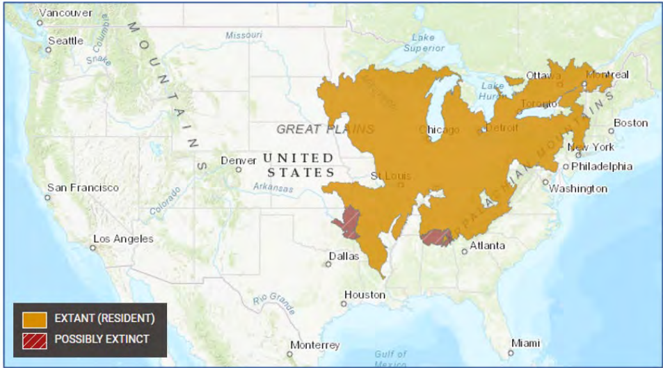
Figure 1. Elktoe distribution (IUCN Redlist 2024)

Trends for New York populations are difficult to determine as most historic data comes from opportunistic naturalist collections, as opposed to more comprehensive baseline surveys. For example, mussels were documented for the first time in 50 of the 106 streams surveyed to date by the Southern Lake Ontario mussel inventory project (Mahar and Landry 2016). This is because many of these streams had never before been surveyed for mussels, not because mussel distribution has dramatically increased. In North America, approximately 2/3 to ¾ of native mussel species are extinct, listed as endangered or threatened, or are in need of conservation status (Williams et al. 1993, Stein et al.2000). Based on New York’s Natural Heritage S-rank, sparse historical data, and the plight of North America’s freshwater mussels, it is assumed that trends are declining due to a myriad of environmental stressors.